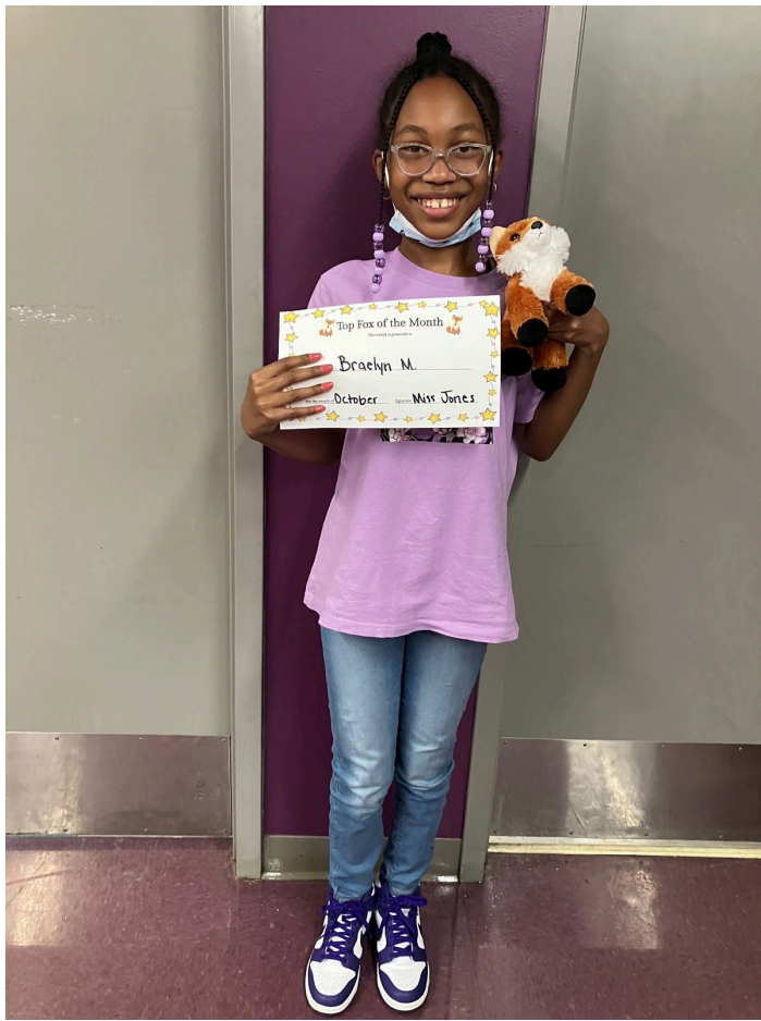
6-8: Zinzi (611)