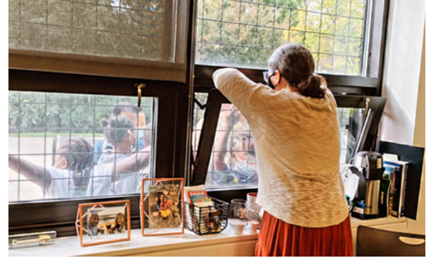
Exchanging hellos with some students at recess