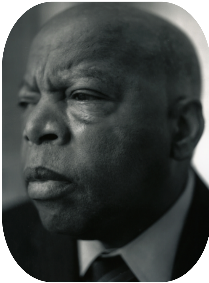
Parting Words from the Inspirational John Lewis