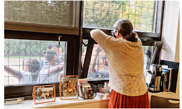
Exchanging hellos with some students at recess